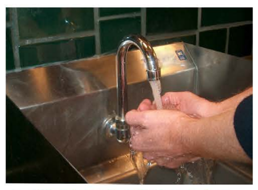
Wet hands with running water,