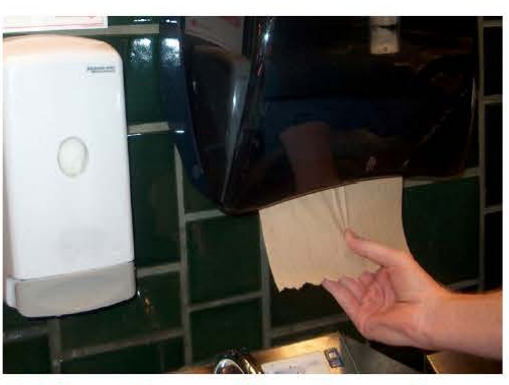
5. Dry cleaned hands and arms

Texas Department of State Health Services