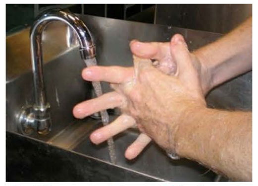
3. Vigorously scrub lathered fingers, fingertips,